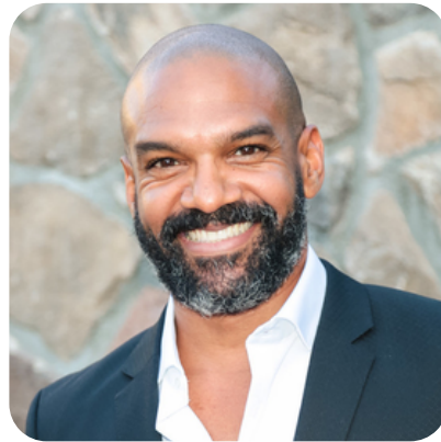
Khary Payton Actor/Storyteller

DATE: March 29, 2025 TIME: 9:00 am - 4:00pm